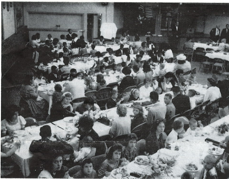
285 enjoyed feasting on Pentecost

The Houston Church of God brethren were privileged to meet for two full days of services during this Pentecost season. God's Church in Houston is enjoying a growth rate of about 30 percent per year giving us a total of 285 in attendance for a joyous festival. These services afforded much encouragement and correction to help qualify us to enter into God's Kingdom.